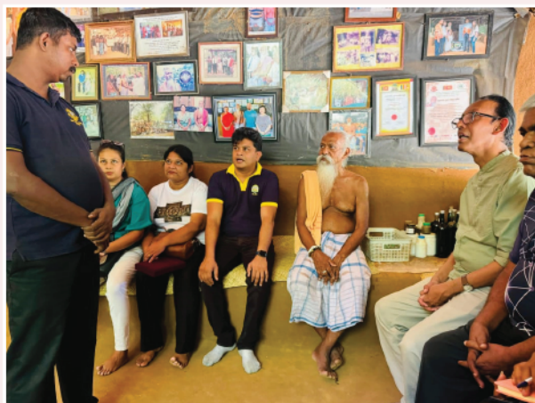
MEETING VEDDA CHIEFTAIN

A unique and meaningful dialogue is taking place between members of the Aquinas College faculty and a Vedda chieftain, representing one of Sri Lanka's most ancient indigenous communities.