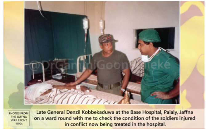
PHOTOS FROM THE JAFFNA WAR FRONT 1990s

In 1982, he took up the post of sole surgeon at the Base Hospital Polonnaruwa , where limited facilities and the civil war created overwhelming challenges. With remarkable resolve, he established an Intensive Care Unit, created a special ward for military casualties, and treated thousands of civilians and soldiers with devastating injuries. Often working in conflict zones at great personal risk, he became known as the surgeon who always went “the extra mile.”